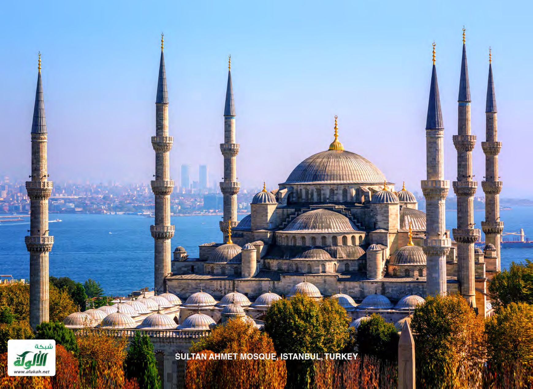
SULTAN AHMET MOSQUE, ISTANBUL, TURKEY