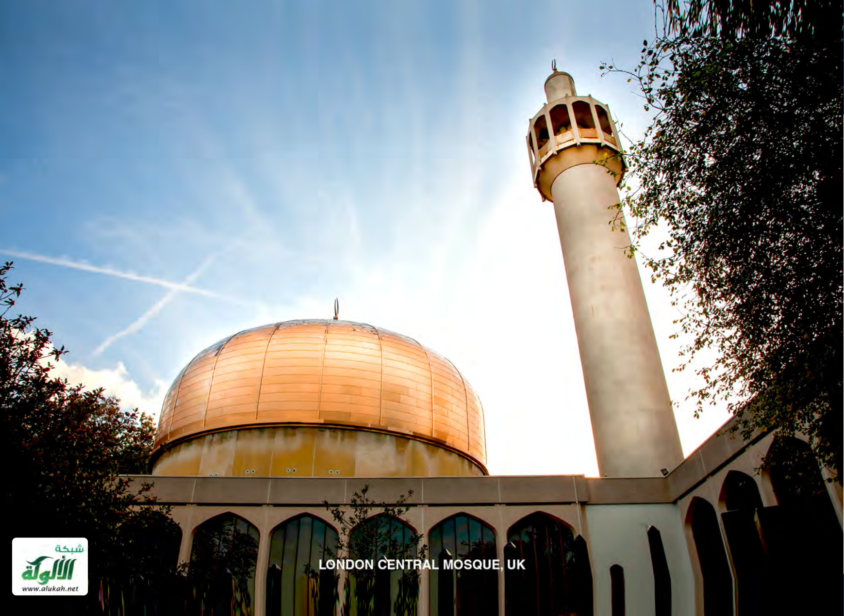
LONDON CENTRAL MOSQUE, UK