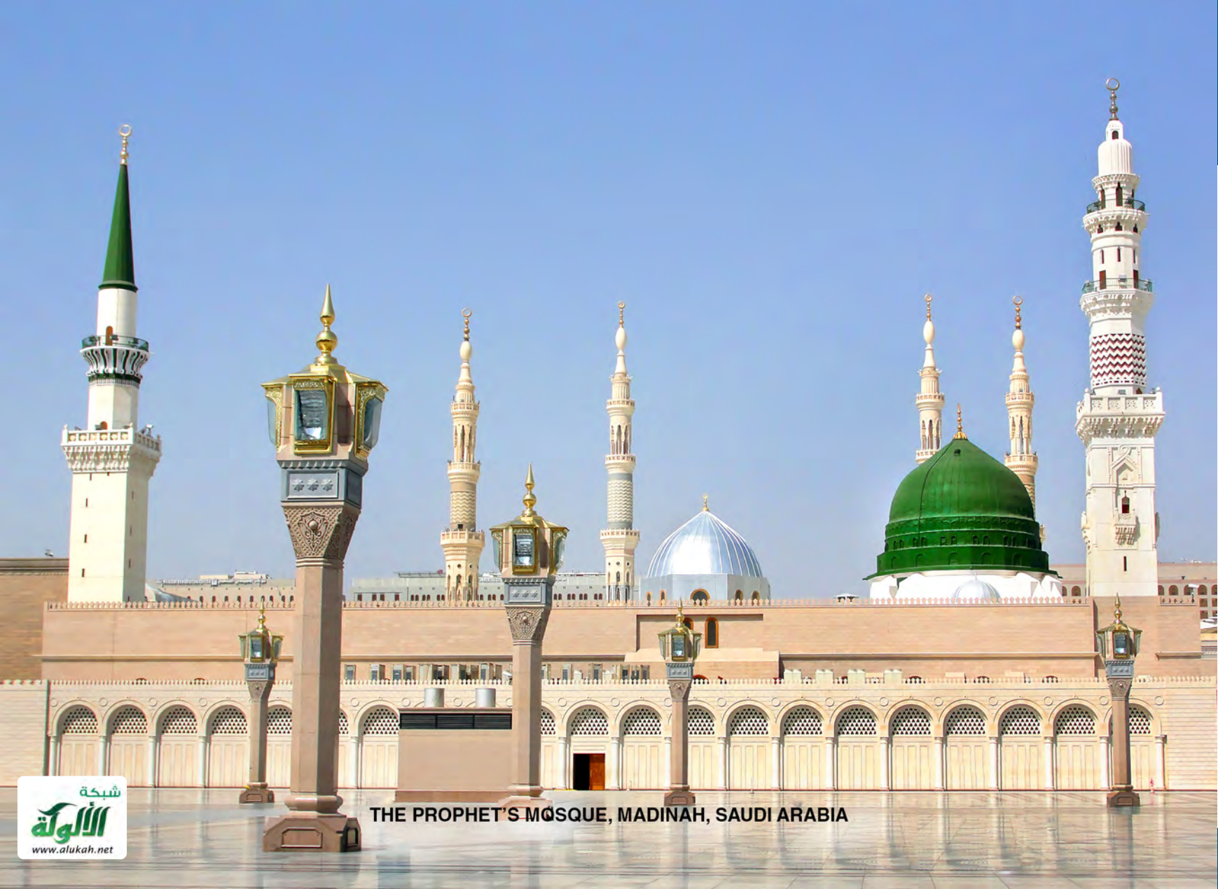
THE PROPHET'S MOSQUE, MADINAH, SAUDI ARABIA