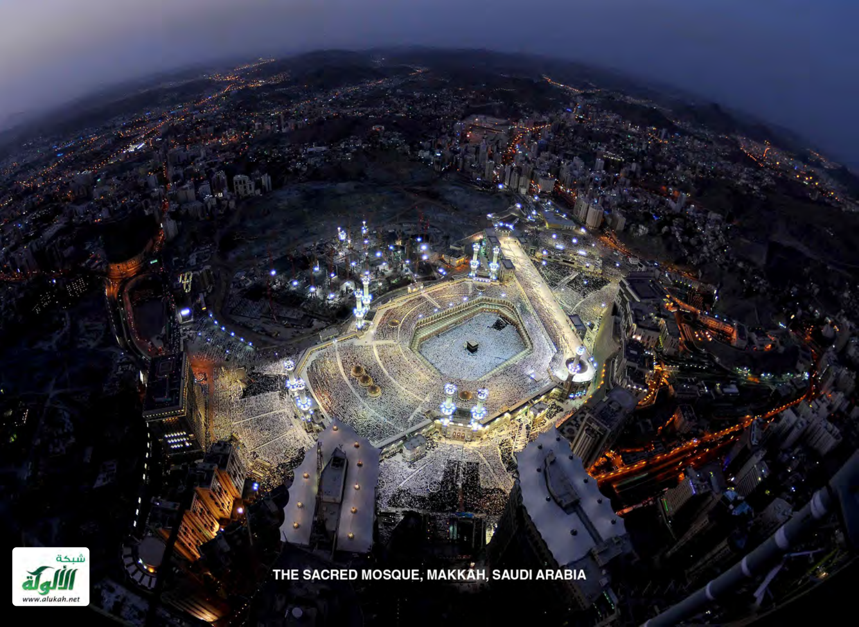
THE SACRED MOSQUE, MAKKAH, SAUDI ARABIA